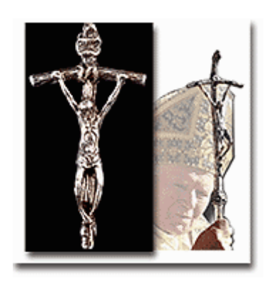
The Satanic Bent Cross

The Bent Cross is a symbol of Satanism that Depicts a starving, toms shoes online, pathetic suffering the Messiah.